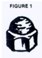
Figure for 408.11103

(3) "Buffing wheel" means a wheel which, when used in conjunction with a compound and a centrifugal motion, will impart a luster to metal, plastics, or other materials. Buffing wheels are of 2 types, as follows: