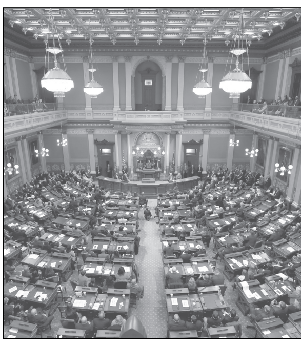
Gov. Gretchen Whitmer delivers her State of the State address to a joint session of the House and Senate on Jan. 25 at the state Capitol in Lansing.