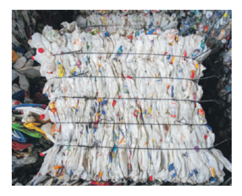
A view of milk containers inside the Emmet County Department of Public Works located at 7363 Pleasantview Lane in Harbor Springs in 2022.