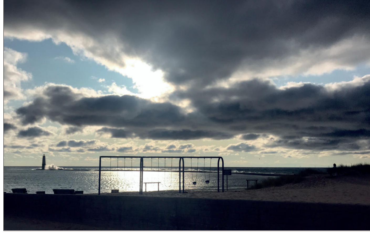
End of a day in Frankfort.